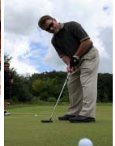
Making new connections and having fun at the 2009 NABA Business/Procurement Conference, Mt. Pleasant, MI.